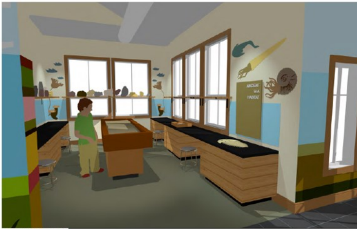
View looking east from room entry

While the Nature Center still features its original exhibits from 2001, plans are underway for an exciting transformation in honor of its 25th anniversary. The proposed updates aim to create an engaging and accessible experience for all visitors. In the last newsletter we explored the reimagined lake habitat exhibit; this article focuses on the final habitat featured in the design, the Devonian Sea.